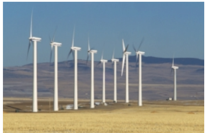
The wind farm at Castle River, Alberta, generates enough electricity to meet the needs of several thousand Canadian homes.

Electricity is now being generated on a commercial scale at large installations called “wind farms” in several places around the world. Wind farms consist of rows of towers, sometimes 90 metres high, equipped with giant wind turbines for producing electricity. In Canada, the first commercial wind farm was built in southern Alberta near the town of Cowley, in a region famous for its strong, steady winds. Commercial wind farms have also been established in Germany, Denmark, the United States, Spain and India. Denmark and Germany have pioneered the development of commercial wind power, one of their fastest-growing industries.