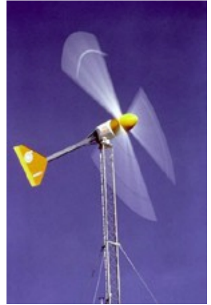
Small, lightweight turbines are available to make electricity for single homes.

ting up poles, overhead power lines and other equipment necessary to connect to the electrical grid. The advantage is that the homeowner owns the generating equipment and is freed from paying monthly electrical bills!