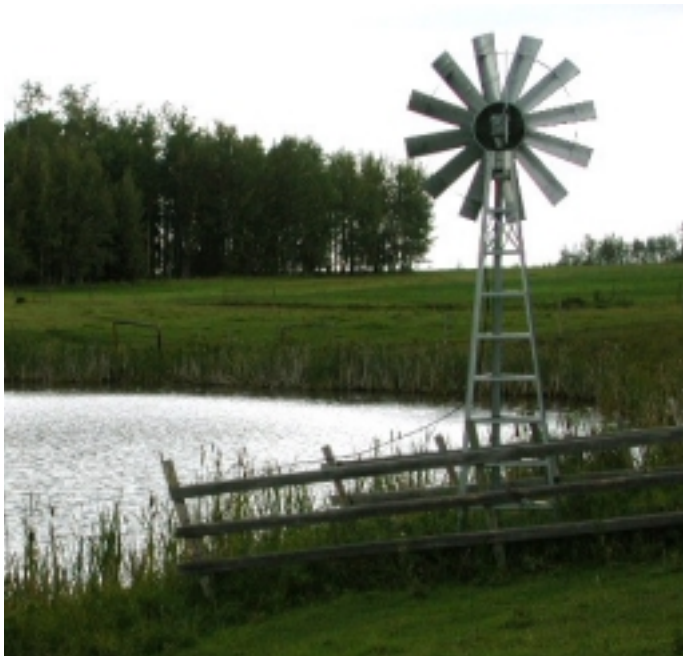
Wind turbines are gaining popularity with cattle ranchers for watering their livestock.

One of the most popular uses of wind turbines is to generate electricity. To make electricity, the shaft of the turbine must be connected to an electrical generator. Through gearboxes, the generator converts the mechanical energy of the spinning turbine shaft into