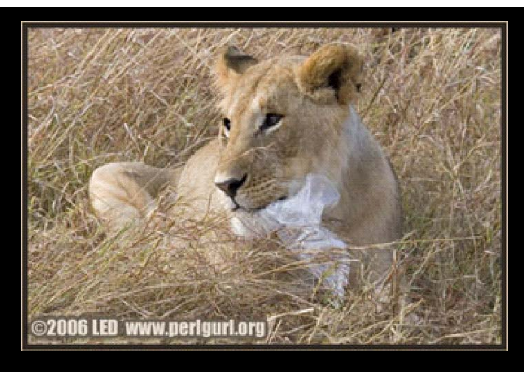
...to different parts of our lands