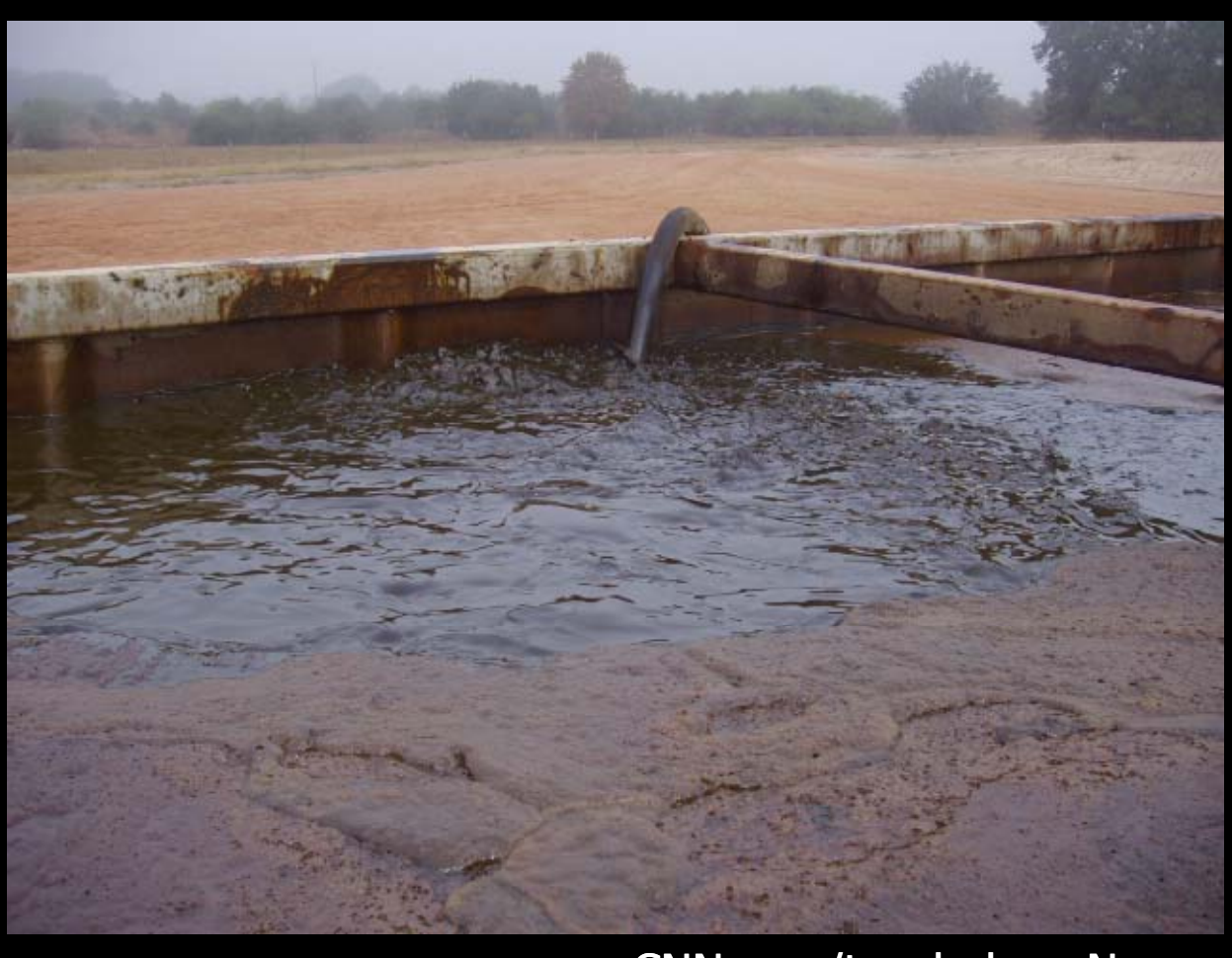
- CNN.com/tecnhology November 16, 2007