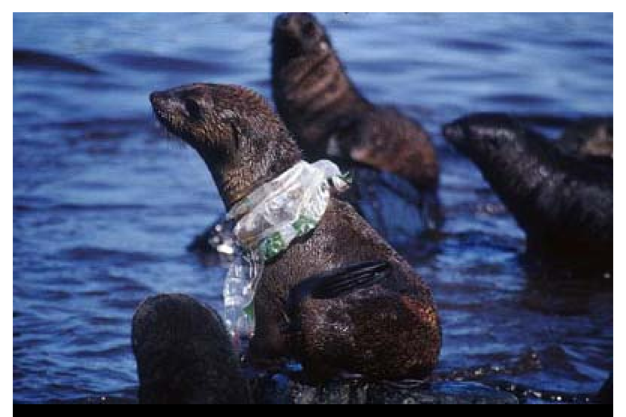
...and to our seas, lakes and rivers.