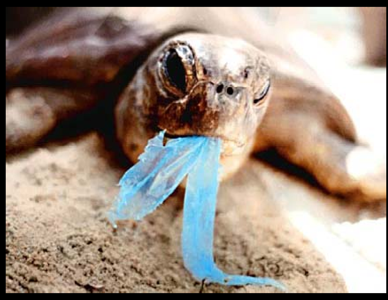
- CNN.com/tecnhology November 16, 2007