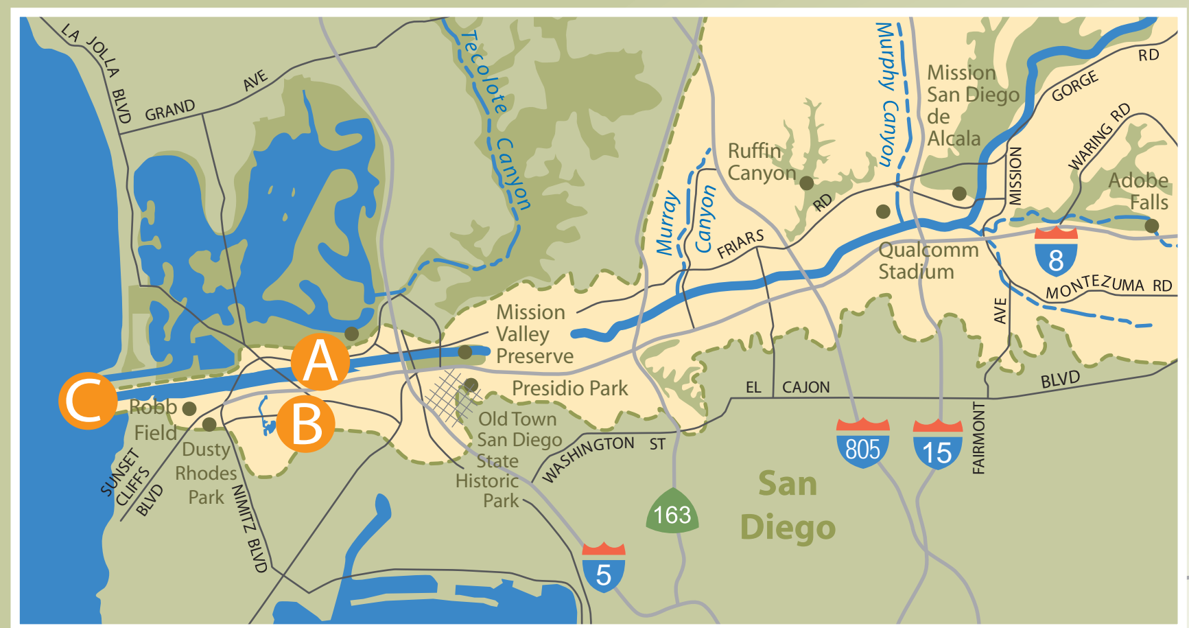
Mission Valley Inset