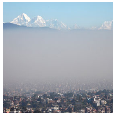
Atmospheric pollution from cities such as Kathmandu drifts up to the Himalayas and the Tibetan Plateau, where persistent chemicals can accumulate.

To trace the sources of those pollutants, Xu and his colleagues correlated meteorological measurements with chemical compositions of