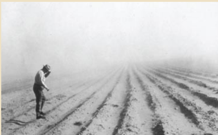
WIND EROSION in the Southern Plains of the U.S. during the Dust Bowl era revealed the perils of plow-based farming.