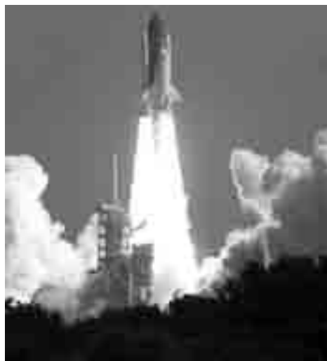
NASA uses hydrogen as a fuel source in the space shuttles.