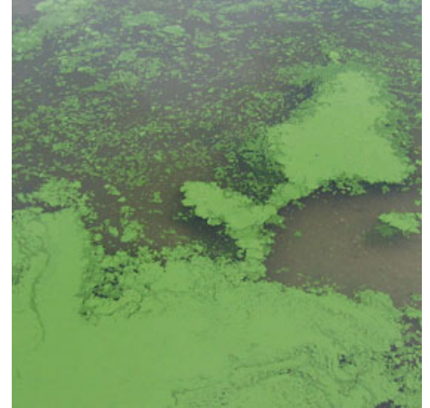
ALGAL BLOOM: Warmer lake waters as a result of climate change have helped prompt algal blooms.

Posch has been studying Lake Zurich for more than a decade. He found that increasing average air temperatures and ensuing changes in